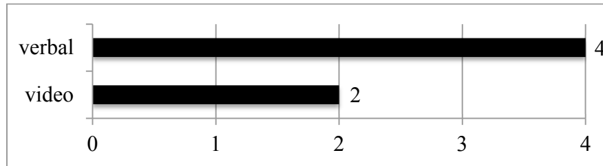
Figure 2. Amount of requests for different materials.

As part of the instructions given, group size was also observed and noted as to number of participants in each group (Figure 3). The participants shown video-based instructions were more likely to follow the instructions, while the participants shown the in-person instructions had an average of two student-groups that did not follow instructions. Because it was the first day of classes, some students arrived after the instructions were given.